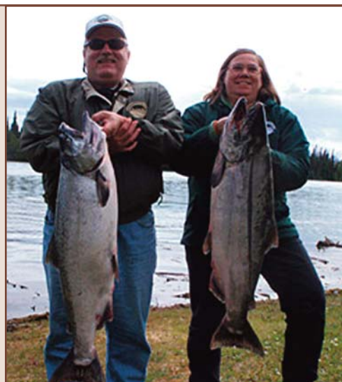
(continued on page 3. Want to learn more about fishing in Alaska, contact your Outdoor Connection franchise owner)

The lodge in Sterling (AF3) is located two hours or less from everything you could want to do in Southern Alaska. With the lodge as your base, you can use their boats in Seward, Homer, or Whittier for fishing or for wildlife/glacier tours. Take a trip into one of the cities for shopping, canoe the Moose river, bike ride, visit bear camp where you can get up close and personal (in a safe way) with a lot of wild brown bears, fish for your limit of Salmon right from the shore, drift fish the Kasilof, catch King Salmon on the Kenai, and more.